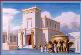
Solomon built the Temple

Managing my life and my belongings in order to reach maximum potential