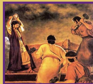
Josiah destroys the idols

Bringing to completion each task I do with excellence