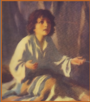
Samuel talks with God

Listening with the ears, eyes, and heart