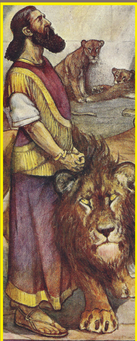
Daniel in the Lions' Den

Standing alone for righteousness and yielding my fears to God