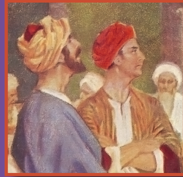
Peter & John on trial

The inner strength to endure tribulation with determination