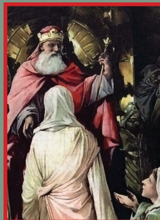
King Solomon's Wisdom